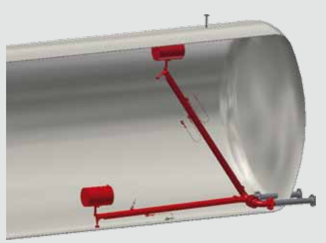
FSU side mounted execution