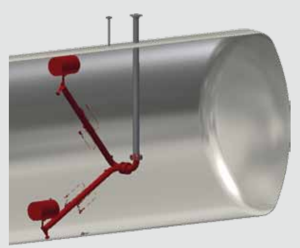
FSU suspended execution for top discharge